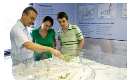
Northern Quarter, Portsmouth: our exhibition at the scheme's outline stage ran for three weeks in a Portakabin on the site and attracted thousands of local people.

Public exhibitions and workshop sessions with all the local interest groups helped us refine our initial proposals considerably. The feedback revealed demand for a second anchor store and as a result we were able to add a John Lewis department store into the scheme.