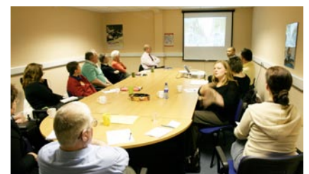
Centros regularly consults local interest groups – from Chambers of Commerce and Civic Societies to local residents and site neighbours. This meeting was with access and disability organisations in Bury St Edmunds, where we paid for a signer to translate for a profoundly deaf representative.

Four stages of consultation helped the scheme evolve into the natural extension of the town's medieval street pattern that will open in spring 2009. The feedback to consultation led directly to the introduction of a 500-seat multi-purpose public venue, widening of the new streets and the addition of underground parking.